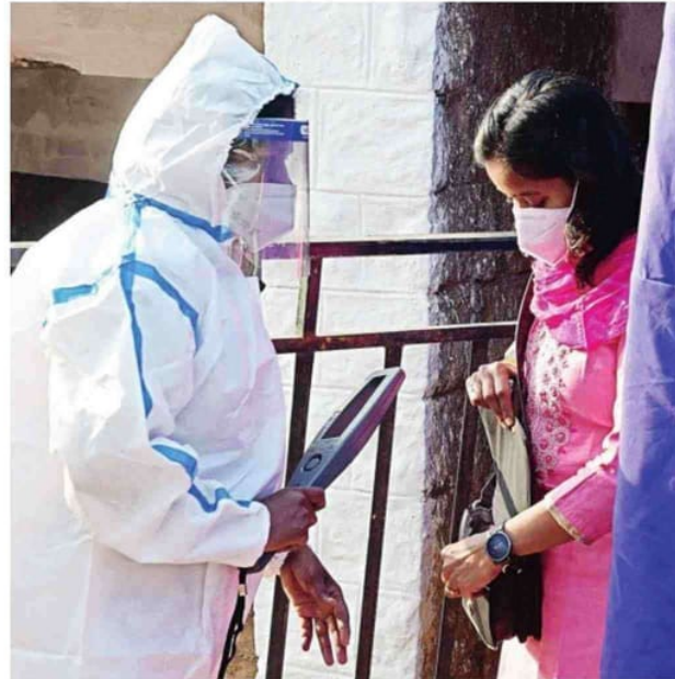
At Republic Day celebrations, citizens get tested by health workers; (below) a graph showing covid trends in major cities

"The number of cases in Mumbai and Delhi appears to be seeing a downtrend since last one week with Mumbai and Delhi reporting 1,815 and 6,028